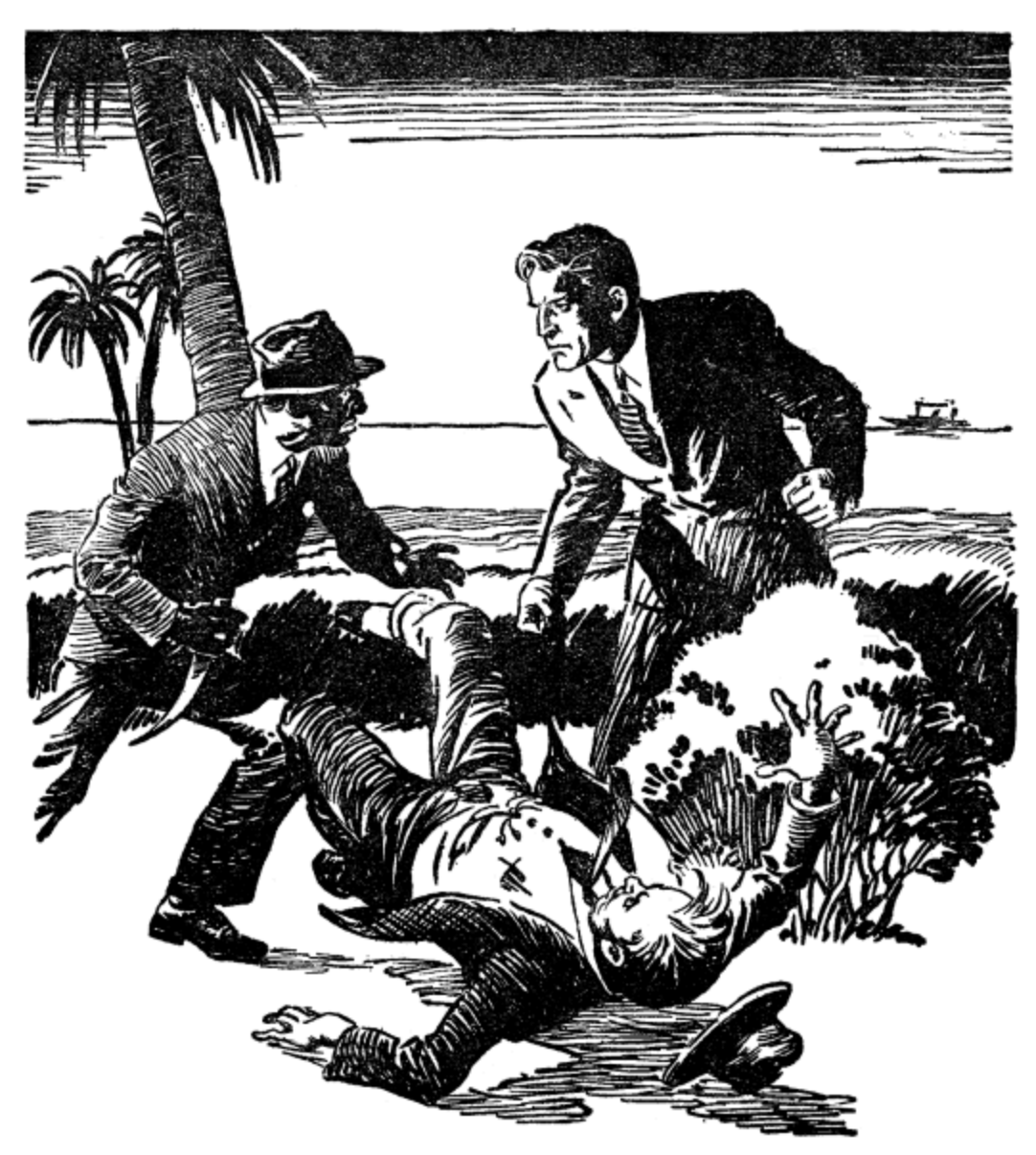
The other man began to hiss. He was like a snake. Rushing in close to Doc Savage, he drew the curved knife back.

struggles became weaker. His mouth fell open, as if the muscles operating it had been cut.