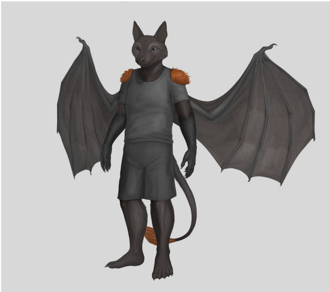
Image: Kitraxian Male

Kitraxians are bipedal winged creatures which range from a normal of 1.5-2.0 meters tall. Average weight is about 90 kg, slightly heavier than human average under Earth gravity due to wing weight and bone density. Kitraxians have a basic humanoid shape, with two legs with a knee joint, two arms with a single elbow joint and five fingers on each hand and four toes on each foot. The main difference from human shape is in the head, wings and tail. The head is more like that of a fruit bat with a nose structure that resembles that of the Flying Fox. The ears are large and can swivel independently. The mouth is more of a muzzle like that on a fox or a dog or a bat. A sharp pair of fangs peek out from under the upper lip and fur of most Kitraxian muzzles, giving them a somewhat feral appearance. The rest of the teeth are sharp and made for grasping and tearing except for a set of four molars on each side (two at the top, two at the bottom) of the back of the jaw. Kitraxian eyes are generally green, blue, purple or brown and have slitted pupils like a cat or a fox.